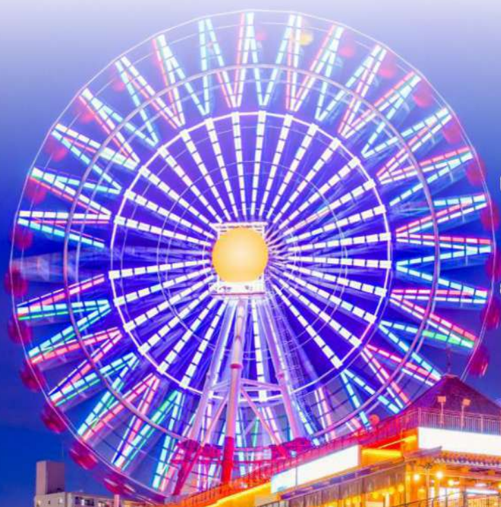
北谷町美国村 Mihama American Village

※ Sequence of the itinerary is subject to change according to the final flight confirmation.