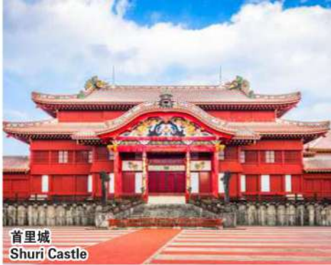
首里城 Shuri Castle