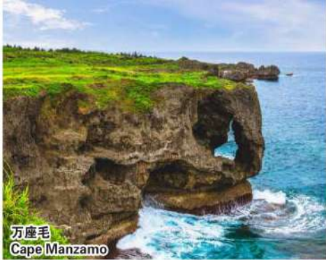
万座毛 Cape Manzamo