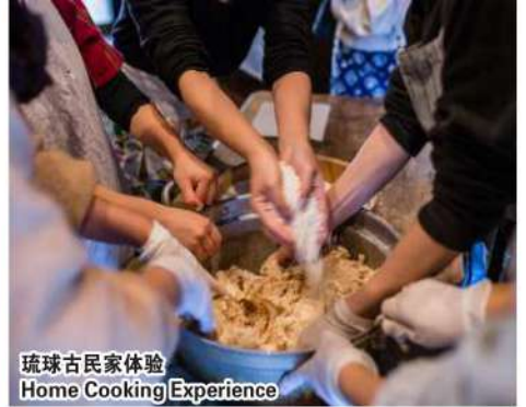
琉球古民家体验 Home Cooking Experience