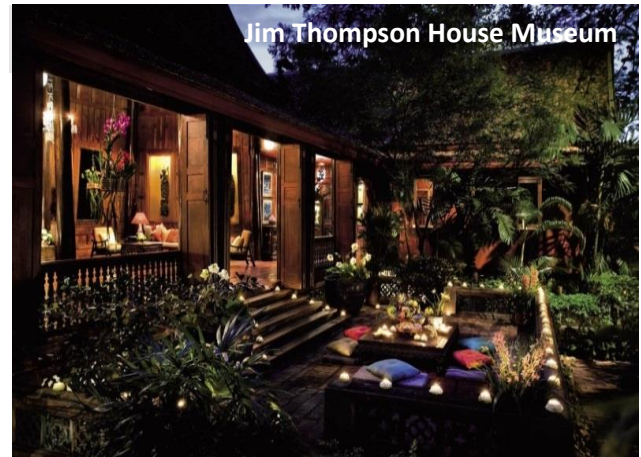
Jim Thompson House Museum

Transfer to the airport for flight check in Depart for home by Flight TBA