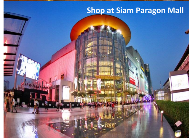
Shop at Siam Paragon Mall